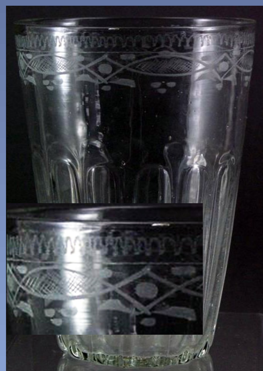
Figure 2: Example of a similar glass with the Stiegel Flip Type I pattern.