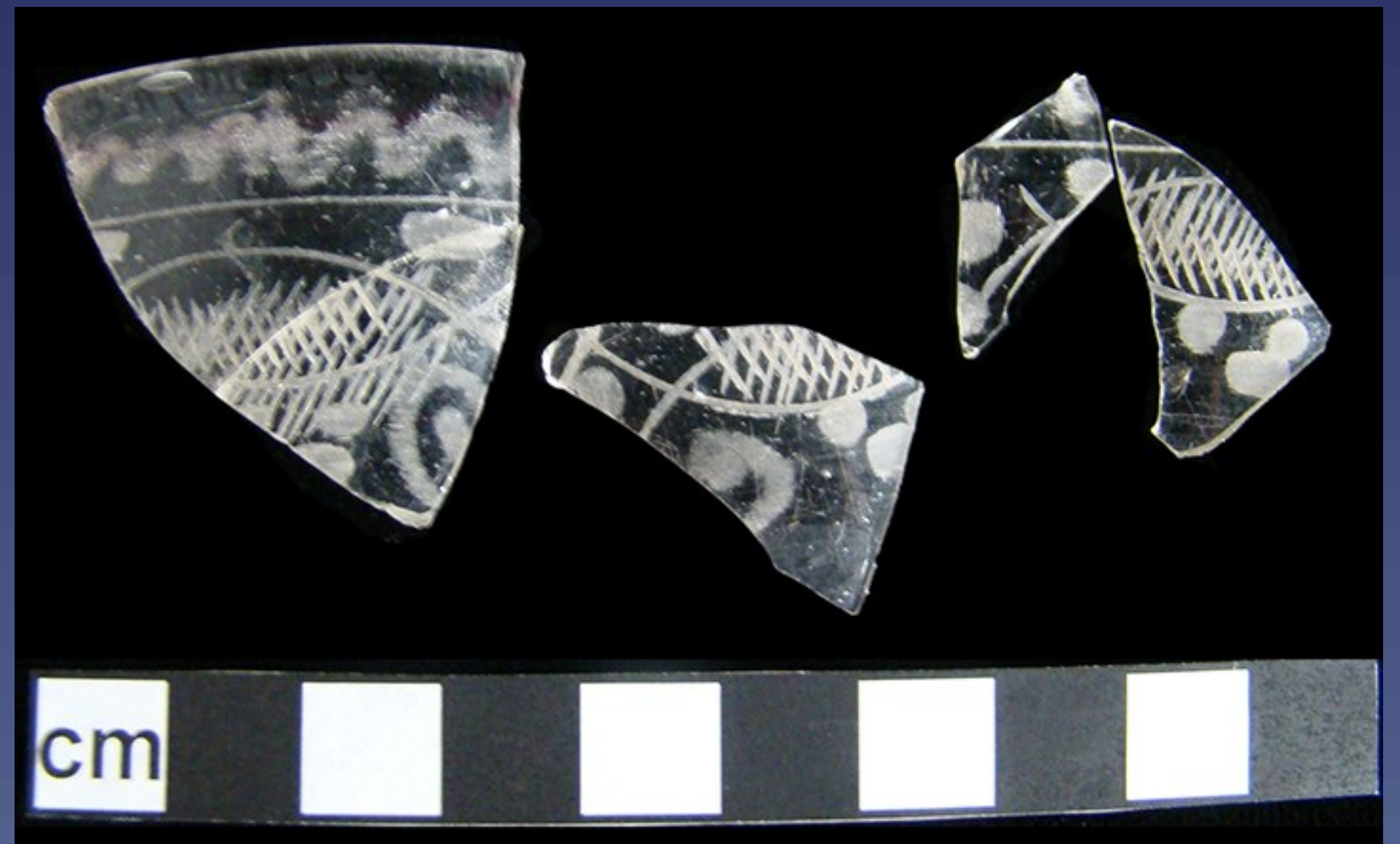
Figure 1: Sherds of glass with Stiegel-Type pattern from Saunders Point.

As often happens with archaeology, the smallest fragments can tell a much larger story. These engraved sherds of glass (Figure 1) were found at the Saunders Point Site (18AN39) in Anne Arundel County. The site consisted of one large cellar hole dating approximately to the 18th century. The fragments are decorated with simple shallow engraving, including a distinct oval shape with hatch marks through it. This pattern, listed by many as Stiegel Flip Type I (Figure 2), was identified by researcher and amateur archaeologist Frederick Hunter, who revived interest in the eccentric glass maker Henry Stiegel and his beautiful works (Daniel 1962:110).